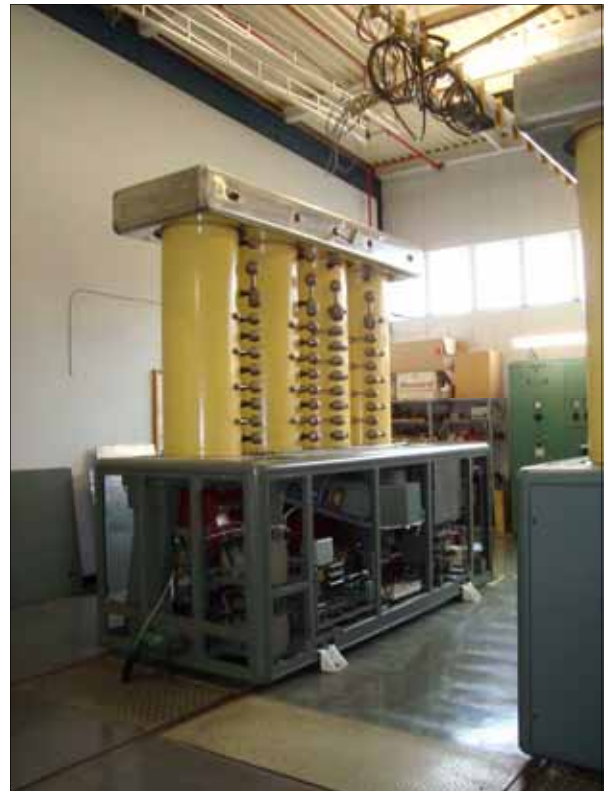
Mercury Arc Valve (HVDC) 1956