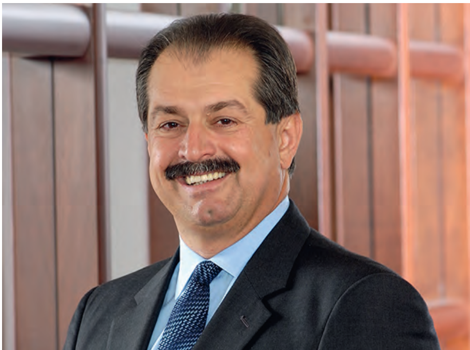
Andrew Liveris would be prepared to assist Australia in setting up an advanced manufacturing taskforce.

Australia has great entrepreneurs and innovators but has lacked the domestic