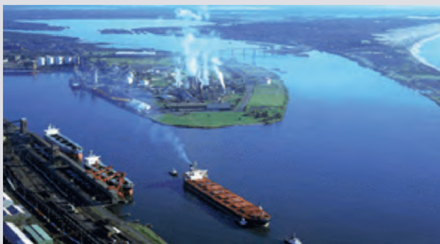
The Orica site at Kooragang Island produces ammonium nitrate for use in the mining industry, and ammonia and nitric acid for use in industrial and agricultural applications.

According to Orica's website, chromium is a naturally occurring element found in soil and rocks. It is released into the environment by natural and man-made processes. It exists in three forms: chromium (0), chromium (III) and chromium (VI). Chromium (VI) is the most toxic of these forms but will transform to chromium III in the natural environment in about 10 days. Chromium (III) is