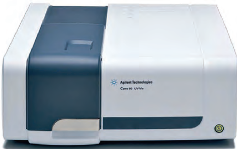
The Cary 60 UV-Vis uses a highly focused beam image to measure small volumes.