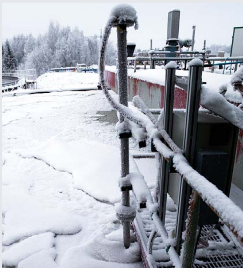
Numcore's CoreHydra sensor and its power supply unit can operate in harsh environments. The device pictured analyses interfaces inside a thickening basin.