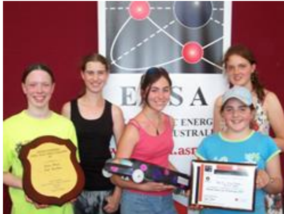
Winners of the 2007 solar model car challenge

Other than the annual awards, the Electrical College Board has not organised any other events. Most activities are at division levels.