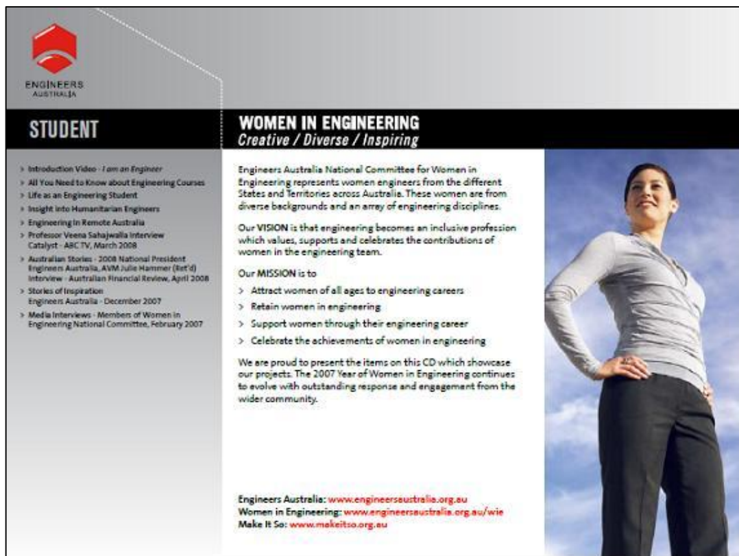
Cover of Student CD for high school girls, August 2009