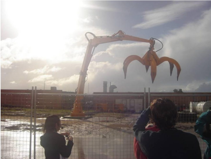
Site Visit to Transmin, 24 June 2009 – demonstration of robots able to move a tonne of material at a time