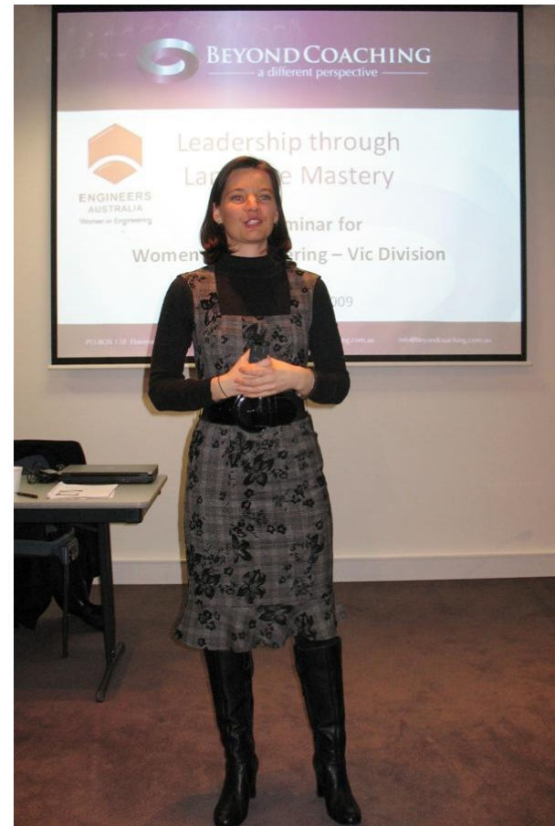
Effective Communication Training Session, Victoria Division, September 2009