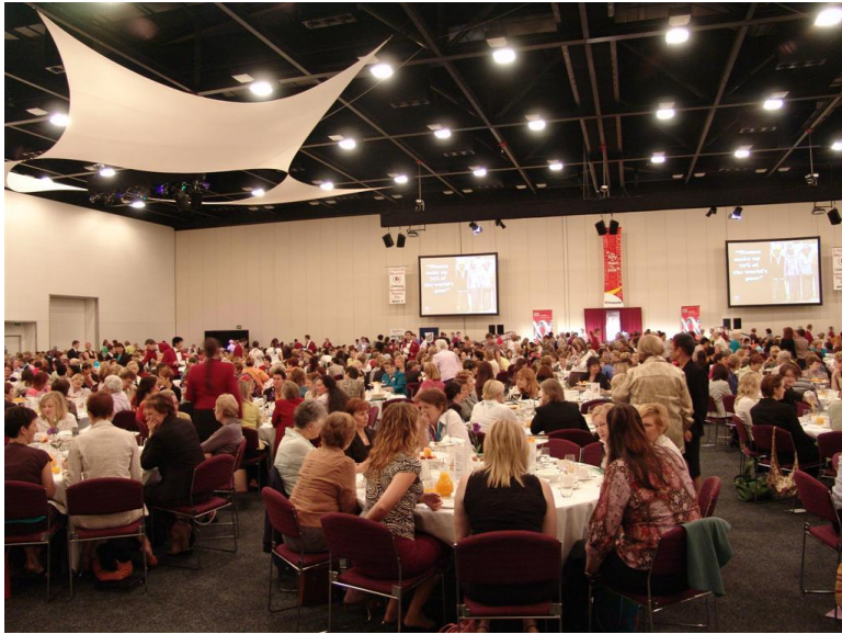
International Women's Day (IWD) Breakfast: This is one of the largest IWD events in Australia.