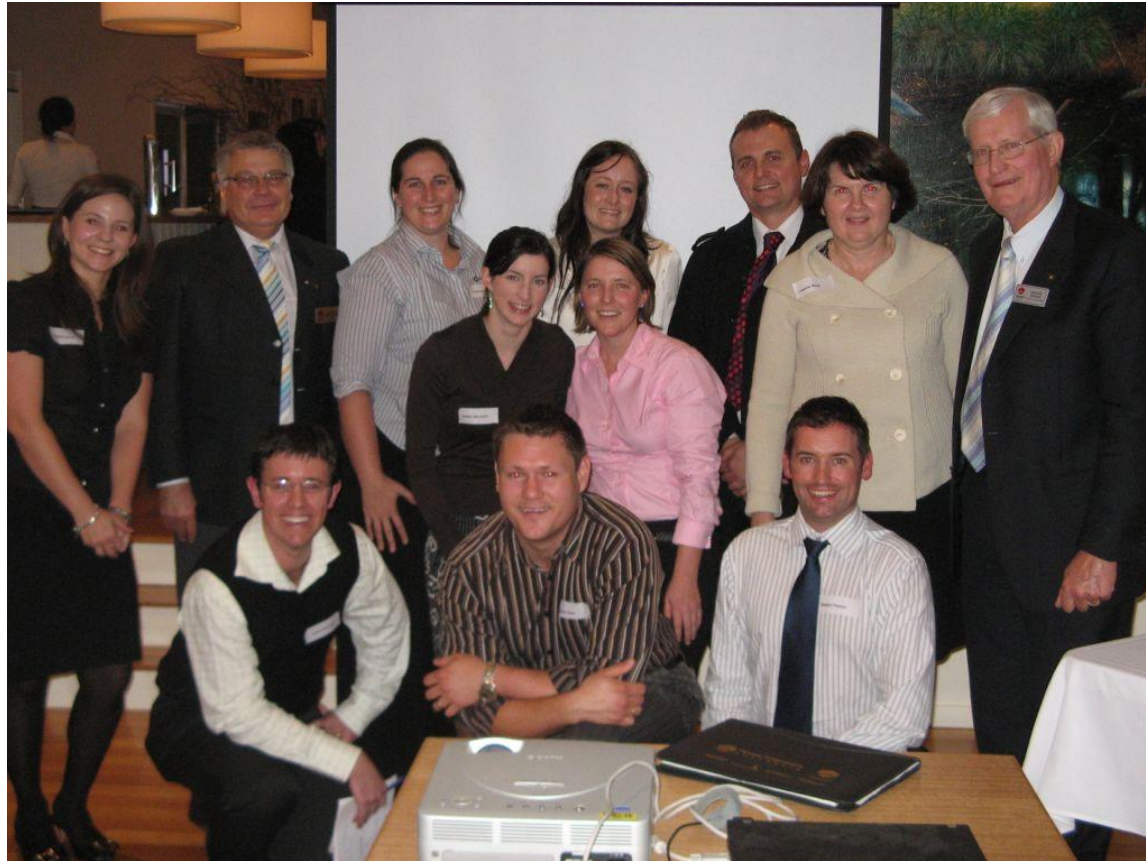
WiE Queensland Division - Gen2X Debate Night