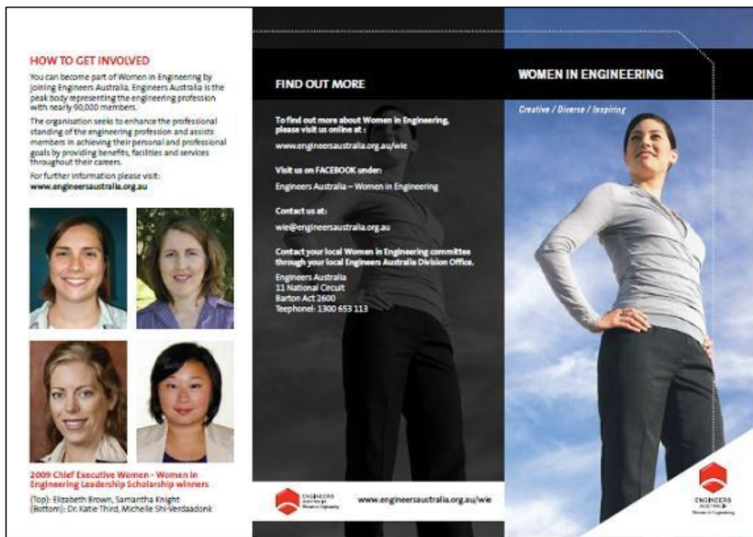
Women in Engineering Brochure, October 2009

The Women in Engineering National Committee Website is located at: www.engineersaustralia.org.au/wie and contains information on publications, course information, media stories and profiles, activity reports and documents for students.