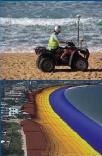
A beach profile being surveyed as part of the COPE field experiment at Burleigh, Gold Coast.

Therefore school leavers need to qualify for entrance to civil or environmental engineering degree courses and should select, and do well in, mathematics and physics at year 12 level.