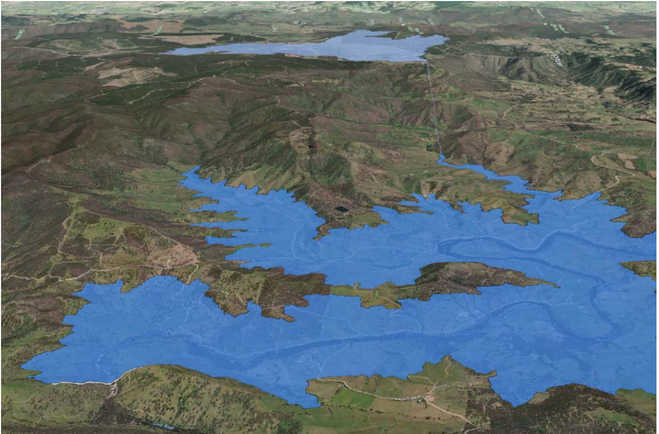
Figure 4: Class AA 1500 GWh site near Lithgow with a head of 620 m